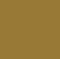
Black Brass - BBR